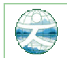
Environment Canada Logo