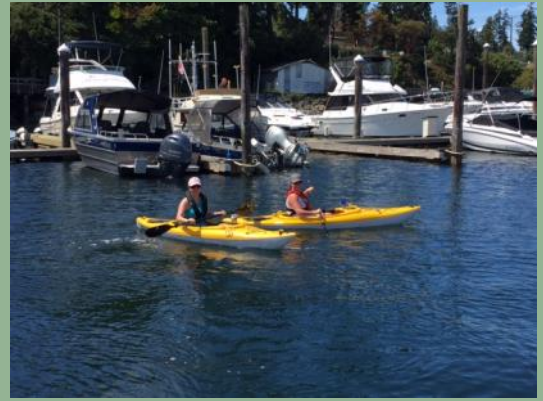
Paddling around Ganges Marina, submitted by Harald of Mer Blue