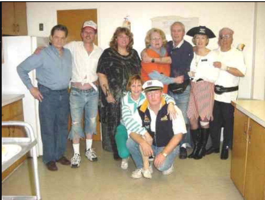
White Rock Squadron Pirates in attendance at Surdel Squadron's Shipwreck Shenanigans on February 24, 2001. They are ready for the District's Pirate Pack Party.