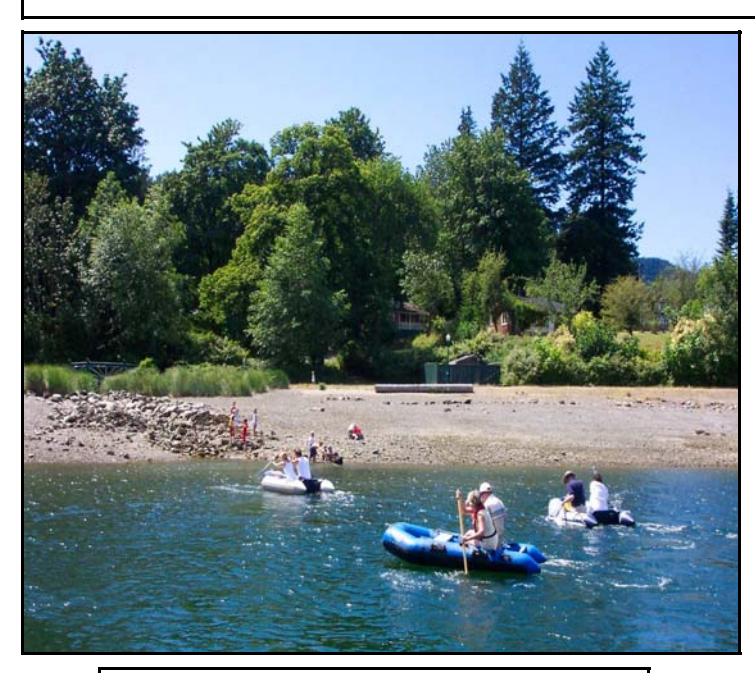
Blindfold dinghy race at Snug Cove.