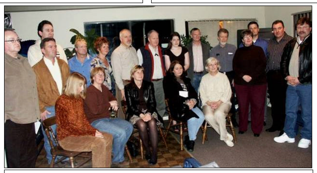
New and proud members of the Squadron, ready to take the member's pledge

For more pictures of the ceremony, click on <a href="http://www.whiterocksquadron.org/photogallery.htm">http://www.whiterocksquadron.org/photogallery.htm</a>