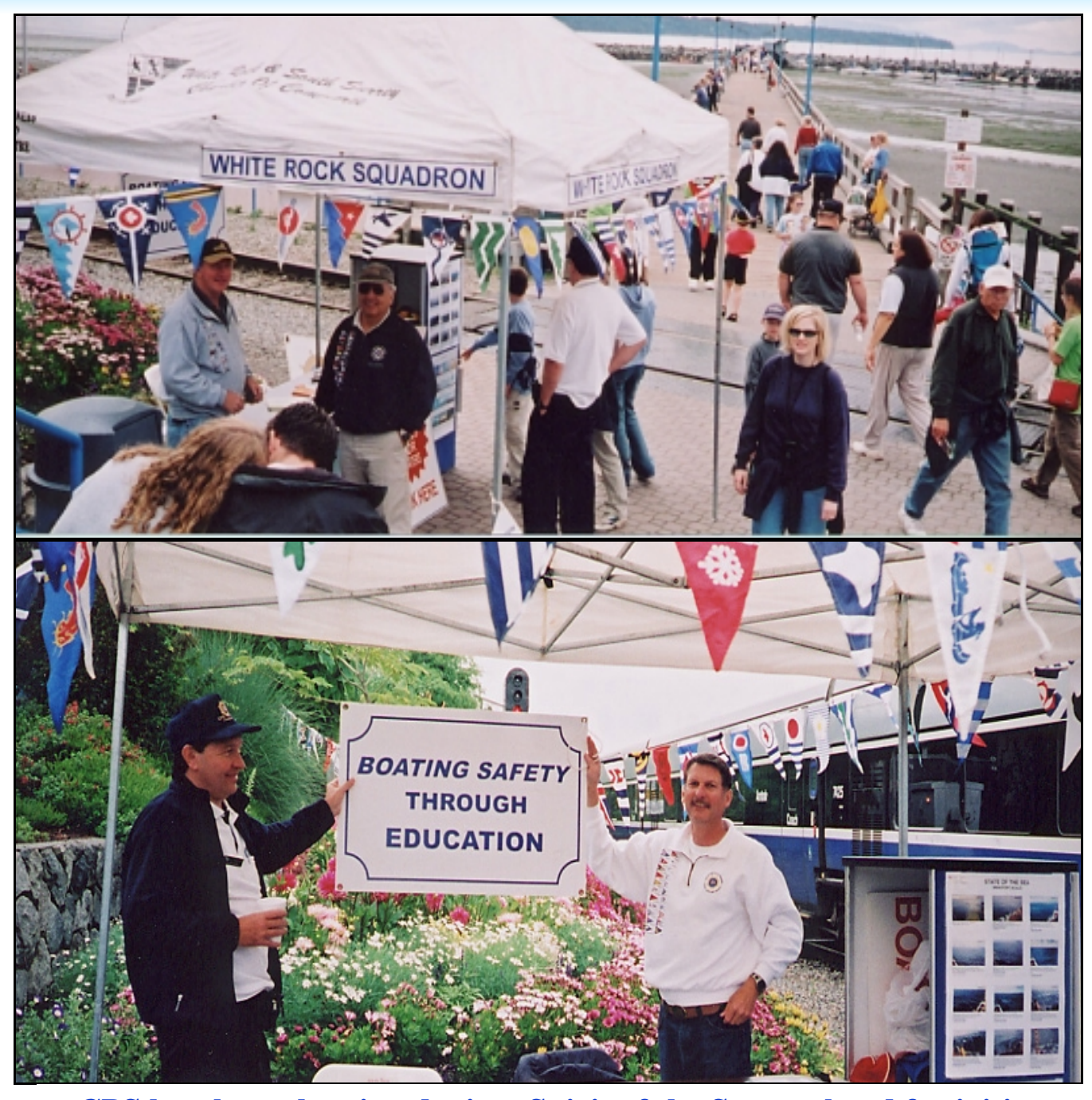
CPS booth at the pier, during Spirit of the Sea weekend festivities...