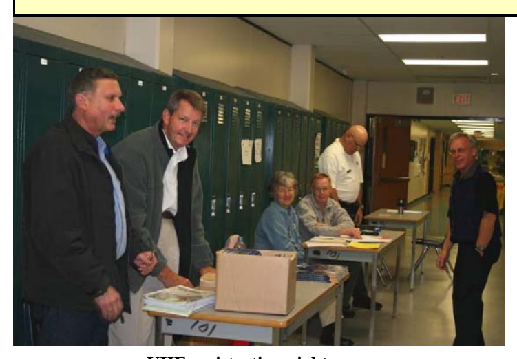
VHF registration night crew