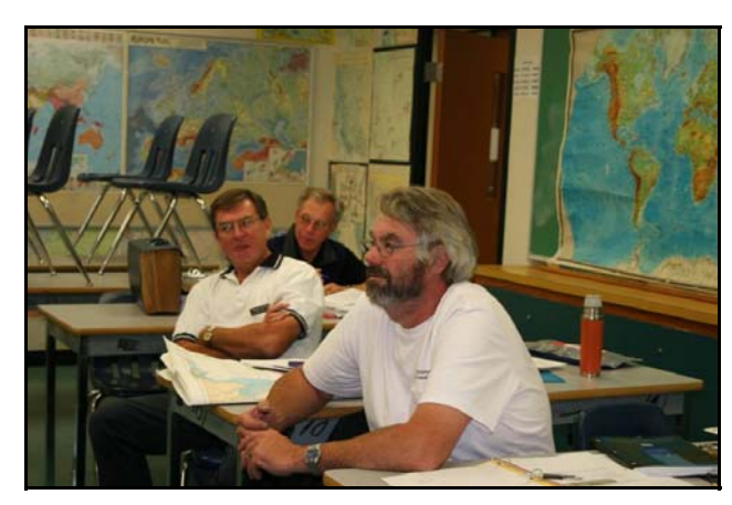
Advanced Piloting class