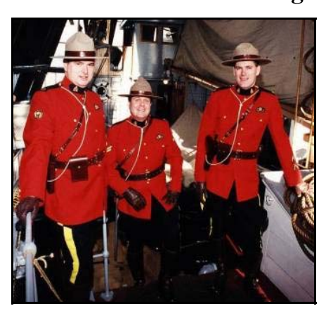
RCMP members and the Governor General following the voyage.